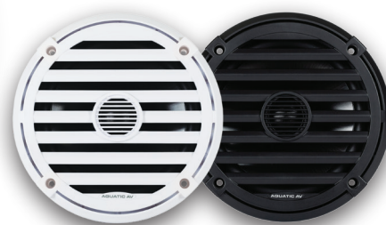
White (EL421) or black (EL422) models available